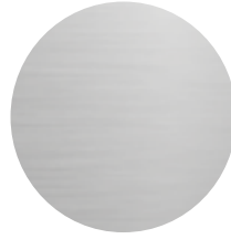
Solid stainless steel