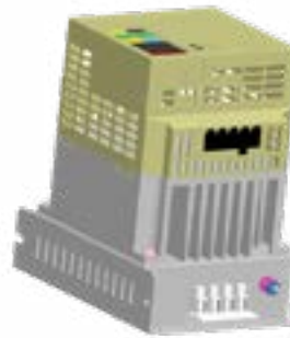
Frequency inverter control cabinet – 400 W