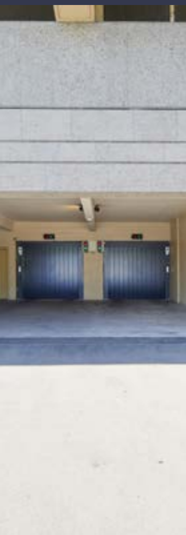
SLYCMA Creation 2023 - Photos by Fabrice Ferrer - SLYCMA - Photos and Illustrations are non-contractual. Subject to change. Reproduction, even partial, is prohibited.